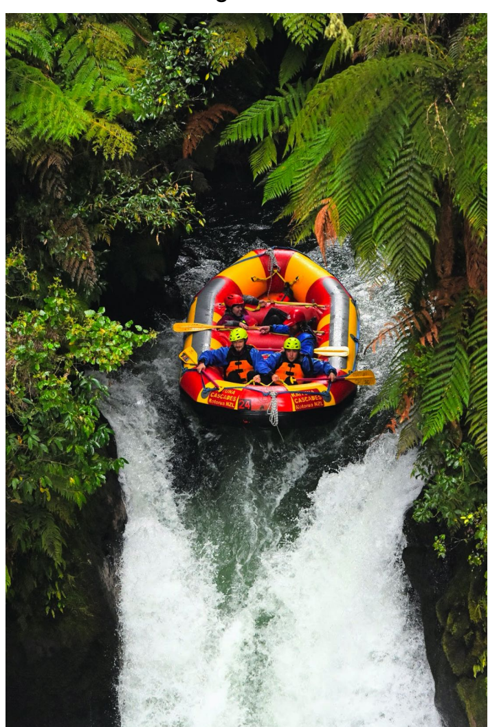
Rafting in Rotorua