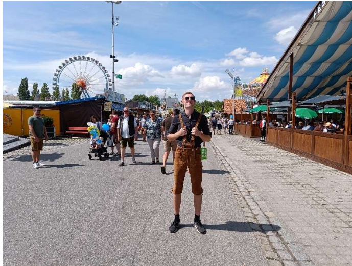
Integrating at the Gäubodenfest in Straubing