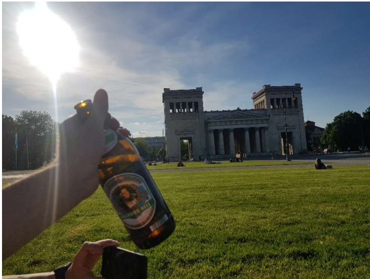
Chilling with a beer at Königsplatz